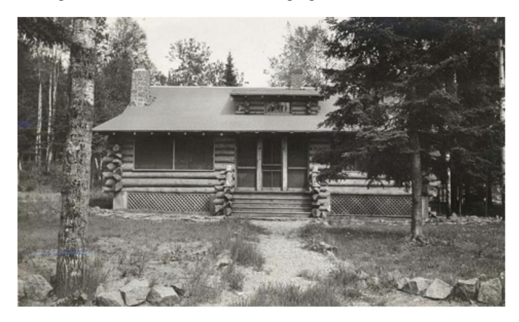
Front view of the Ranger Dwelling in 1934. Exposure was taken from the west.

USFS Halfway Ranger Station Historic District (HRSHD) Building Superior National Forest - USFS has proposed to demolish the site