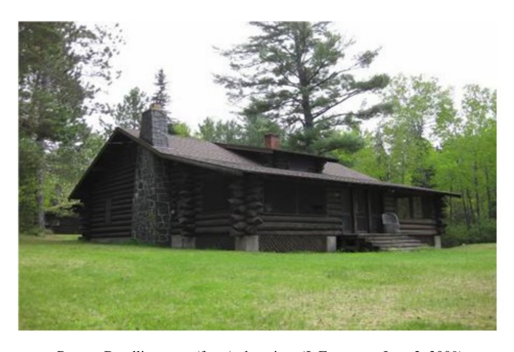
Ranger Dwelling west (front) elevation. (J. Ferguson: June 2, 2009)