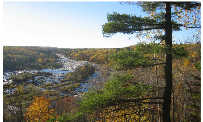
Jay Cooke State Park near Duluth

Back to www.sosbluewater.org