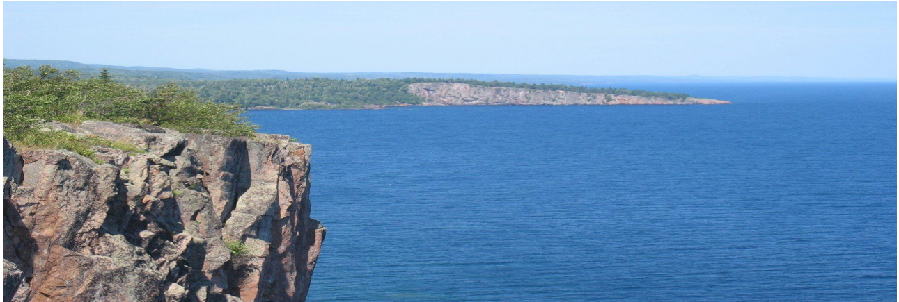
Minnesota's Palisade Head on Lake Superior