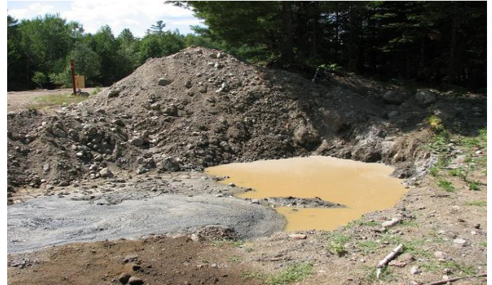
Mineral Exploration residue along the Kawishiwi River near the BWCAW

were originally purchased for watershed protection, thus halting open pit mining on USFS land as proposed by PolyMet.